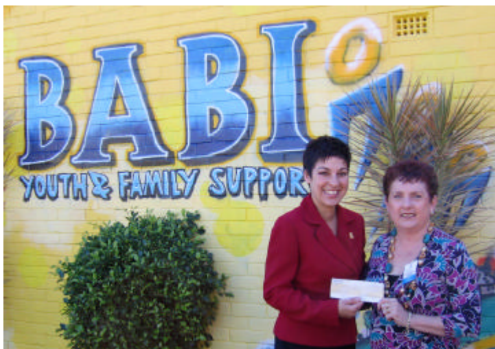
Presentation of cheque to BABI Youth & Family Support

The Trust assessed the business case as meeting its criteria and approved a grant of $30,000 to BABI to be used to provide additional accommodation through either rental accommodation, purchase of a 12 month motel occupancy or the payment of a deposit on a new property. The grant was given unconditionally but the Trust indicated that it preferred to funds be used for the more sustainable option of a deposit on new accommodation.