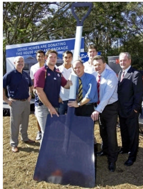
Ground-breaking Ceremony Sunnybank

The Trustees wish to thank Devine Ltd and its partners Channel Ten, Triple M, and Bendigo Bank and the many organisations in Brisbane who have generously pledged support in the form of labour or made donations of cash or material. Their generous support in assisting the Trust to meet its fund raising target of $1 million is greatly appreciated.